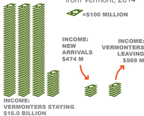
Data source: IRS Statistics of Income ©2016 Public Assets Institute

and nearly 13,500 moved in. The biggest year for newcomers was 2001, when almost 17,500 came from other states. The biggest exodus was in 2006, when more than 16,600 people left.