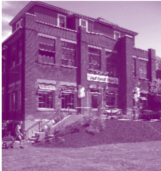
The former Vermont Maid plant is one of the industrial buildings that have been given new life by businesses like the Great Harvest Bread Company in Burlington's thriving South End.

Its turnaround is celebrated with the annual South End Art Hop, when work from area artists literally overflows into the streets and on to the walls of local companies, creating an extraordinary sense of community and expression. This festival draws over 10,000 people, generating revenue for artists, increasing awareness of the South End throughout the region, and attracting businesses to relocate.